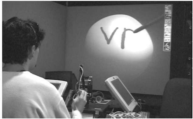
Figure 3. System Setup with User Interface

inTouch contains a multiresolution mesh editing subsystem which takes the position of the probe on the model and the direction of applied force as input. Together, these parameters define a geometric change to the model at a certain