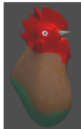
Figure 1. A Rooster Created & Painted by inTouch

In the computer graphics, user interface, and VR communities, researchers have developed numerous techniques for 3D interaction comprising object selection [PFC + 97], flying, grabbing and manipulating [RH92], miniature worlds [PBBW95], different modes of speech, gesture and