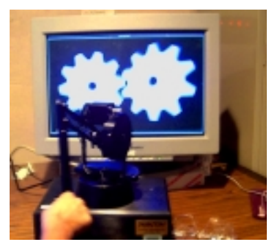
PLATE I . The Image on the left shows the contact scenario for the gear demo. We test the red primitives against the blue primitives. The image on the right shows the user manipulating the gears using the 6-DOF PhanToM device.